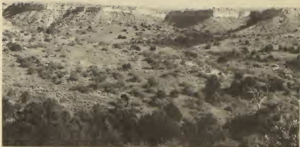
FIG. 9.—Canadian breaks in northwestern Roberts County. Bats were netted over intermittent stream at clump of trees in right-of-center background.